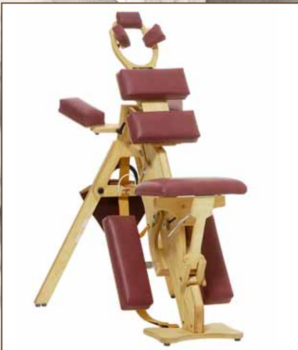
The Energy Chair